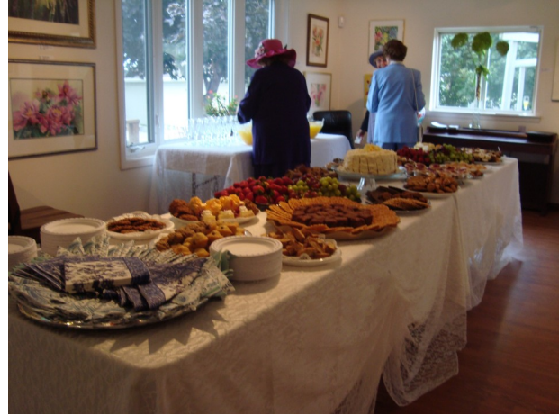
President's Tea goodies