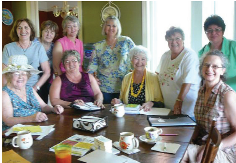
The ladies of the WAAH held their monthly executive meeting at the event.