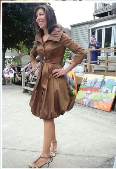
The show as held in the Sunrise Gallery garden overlooking Lake Ontario.