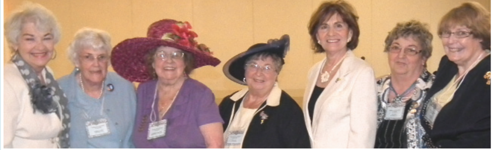
Some of the ladies of the WAAH.

The Grand Olympia, Stoney Creek was a lovely venue for our annual meeting and the turnout of members was quite remarkable. Everyone had a good time and had a chance to visit with other members, enjoy a delicious lunch and meet new members as well.